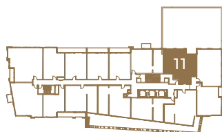
7 th floor outdoor 249 sq.ft.